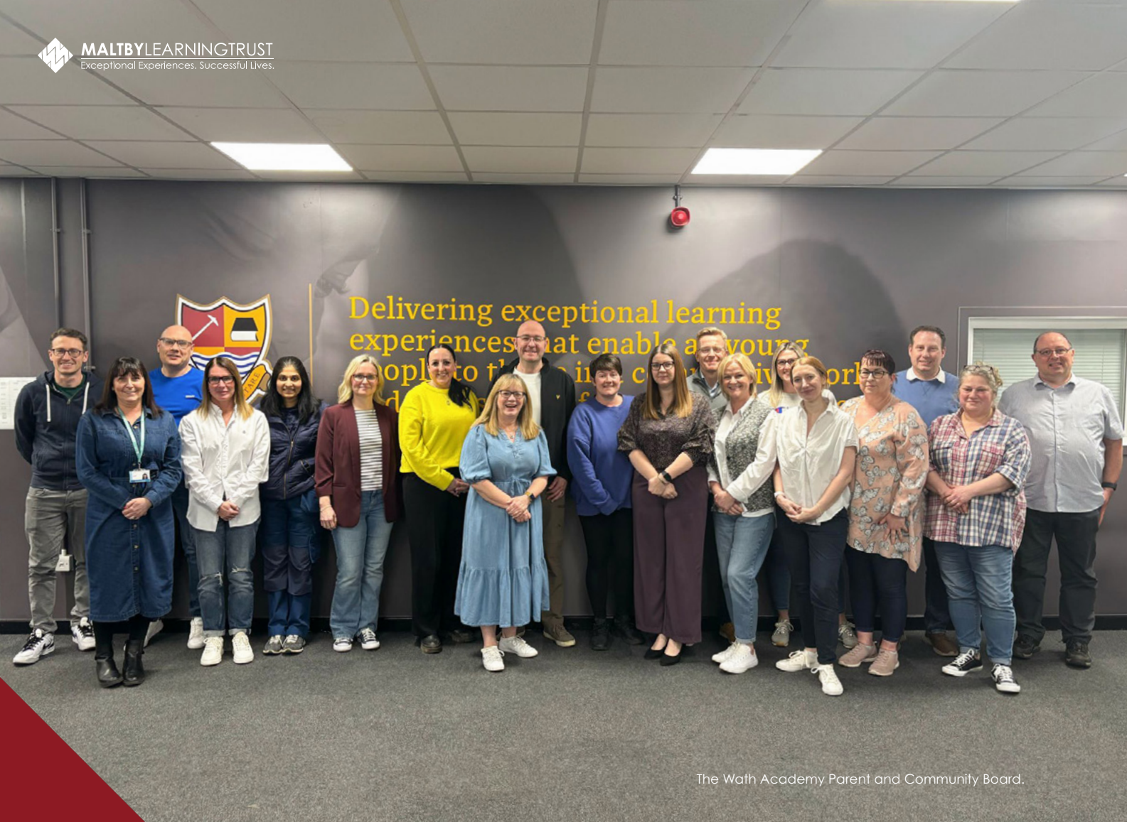
The Wath Academy Parent and Community Board.