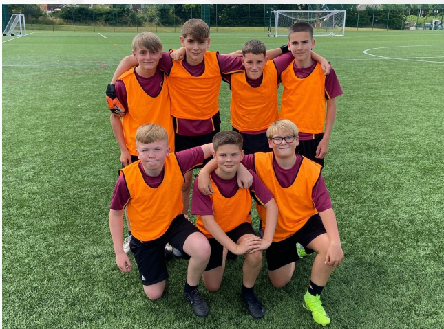
A Thebes football team, dressed in their house colours