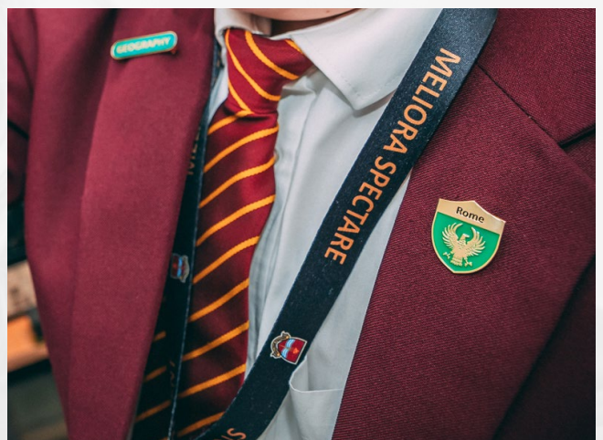
House badges are part of the school uniform

House captains are elected from Year 12 students. They help organise house events and gain valuable leadership experience for their UCAS applications or CVs.