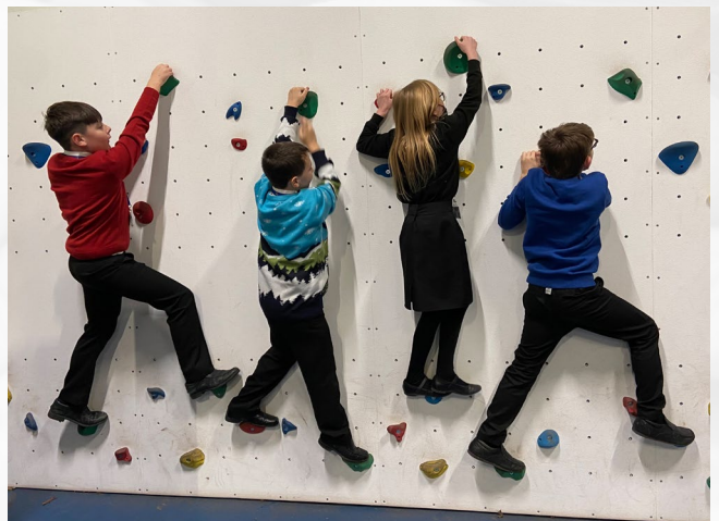
A festive house climbing wall event... in Christmas jumpers