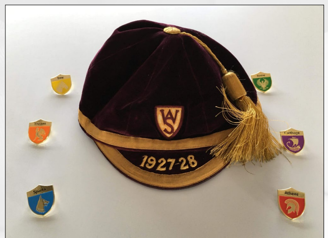
The 'sorting hat' used to allocate students to houses in their first assembly

Guest speakers are often invited to speak at these assemblies, often about a house value.