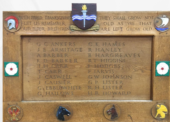
Above: Part of the school's war memorial, which includes the badges of all six houses

Today, the house system has been modernised for the 21st century, but is still built on the same sense of community envisaged by the school's founders.