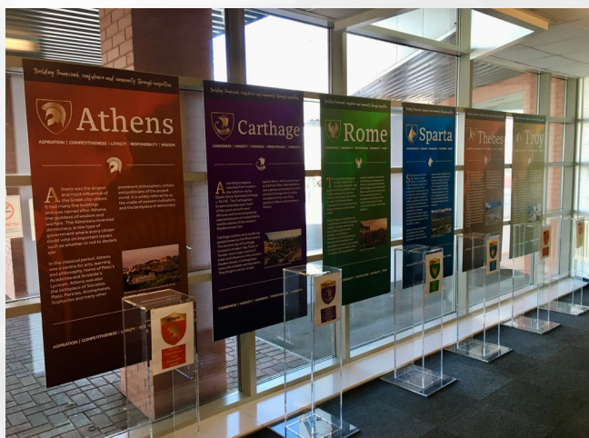
Information about the houses is proudly on display in reception

An online quiz is available to complete every week, as well as a half termly Creative Challenge, judged by the Senior House Link. Both challenges are often linked to events like World Book Day or Careers Week. Points are awarded to the best entries.