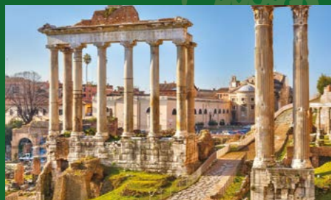
Roman Forum, Rome, Italy.

CONFIDENCE | CREDIBILITY FAITHFULNESS | RELIABILITY | TRUST