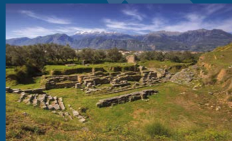
Ancient ruins of Sparta, Greece.

CONSIDERATION | COURAGE ENDURANCE | TEAMWORK | VISION