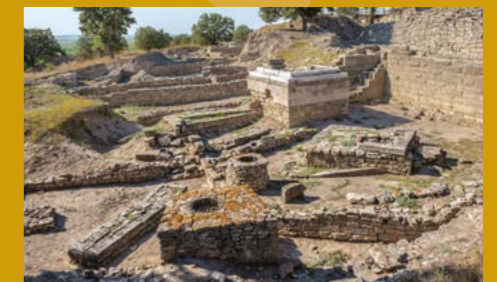
Ruins of ancient legendary city of Troy in Canakkale, Turkey

CURIOSITY | DEDICATION | INGENUITY PRUDENCE | TOLERANCE