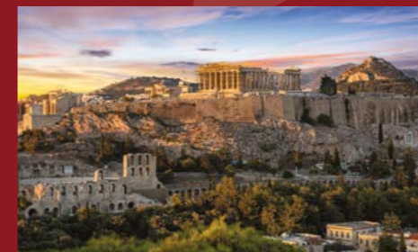
Parthenon, temple dominating the hill of the Acropolis, Athens.

ASPIRATION | COMPETITIVENESS | LOYALTY RESPONSIBILITY | WISDOM