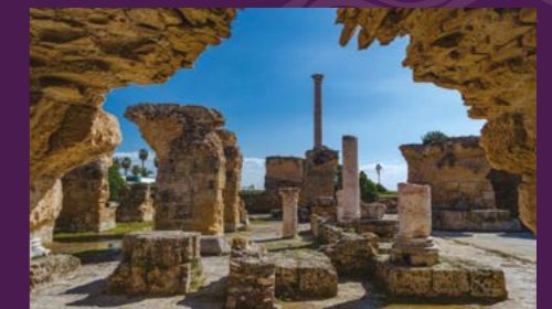
Ancient ruins of Carthage, Tunisia.

CANDIDNESS | HONESTY | KINDNESS PERSEVERANCE | STRENGTH