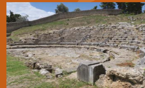
Ancient Theatre in Boeotia, Greece.

AMBITION | DETERMINATION ENTHUSIASM | FOCUS | OPTIMISM