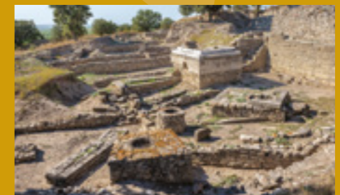
Ruins of ancient legendary city of Troy in Canakkale, Turkey

CURIOSITY | DEDICATION | INGENUITY PRUDENCE | TOLERANCE