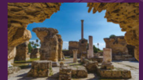
Ancient ruins of Carthage, Tunisia.

CANDIDNESS | HONESTY | KINDNESS PERSEVERANCE | STRENGTH