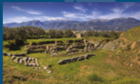
Ancient ruins of Sparta, Greece.

CONSIDERATION | COURAGE ENDURANCE | TEAMWORK | VISION