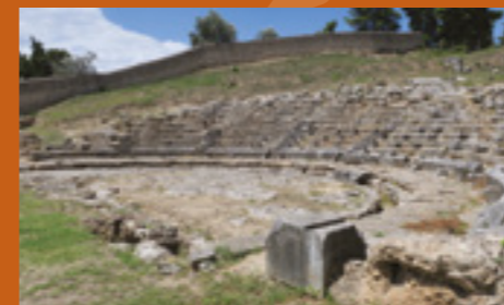
Ancient Theatre in Boeotia, Greece.

AMBITION | DETERMINATION ENTHUSIASM | FOCUS | OPTIMISM