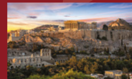
Parthenon, temple dominating the hill of the Acropolis, Athens.

ASPIRATION | COMPETITIVENESS | LOYALTY RESPONSIBILITY | WISDOM