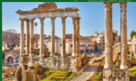
Roman Forum, Rome, Italy.

CONFIDENCE | CREDIBILITY FAITHFULNESS | RELIABILITY | TRUST