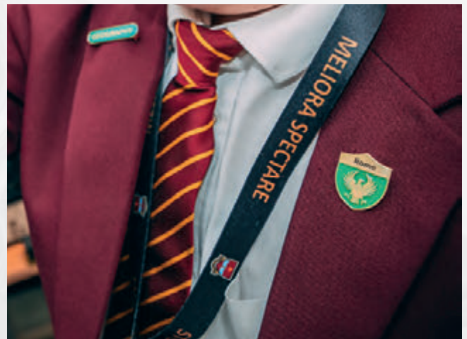
House badges are part of the school uniform

House captains are elected from Year 12 students. They help organise house events and gain valuable leadership experience for their UCAS applications or CVs.