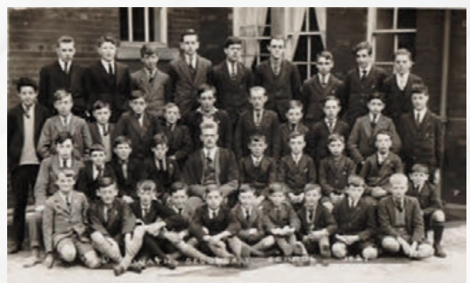
Below right: Sparta boys, also in 1927