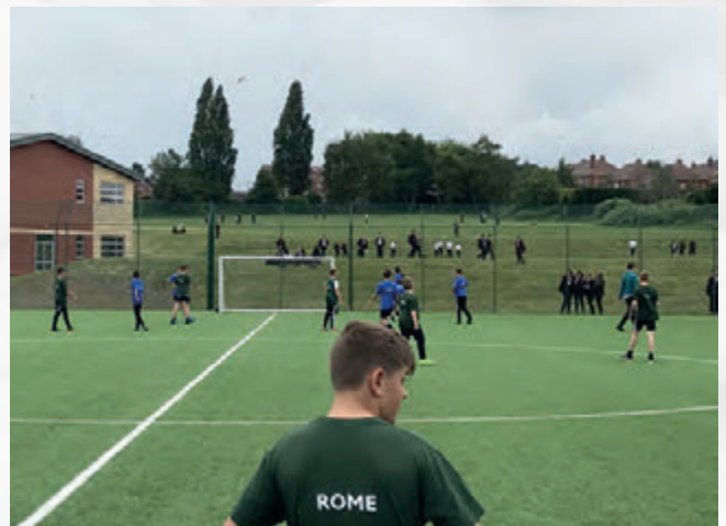
A Rome player watches over his teammates on the football field