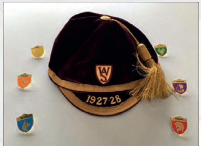
The 'sorting hat' used to allocate students to houses in their first assembly

Guest speakers are often invited to speak at these assemblies, often about a house value.