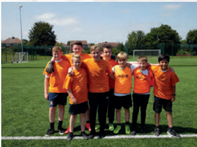
Members of Thebes about to take part in a house football match