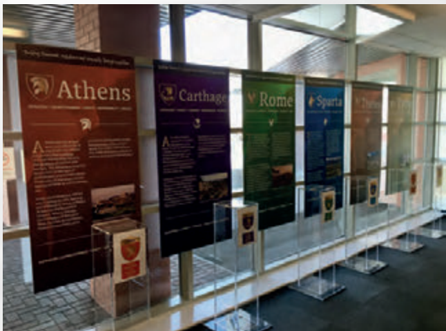
The entry point for the 'box entry' competitions near reception

A 'box task' is held every fortnight. A paper-based challenge, often linked to events like World Book Day or Careers Week, is set. Students post their submissions into boxes in the school reception. Points are awarded to the best entries.