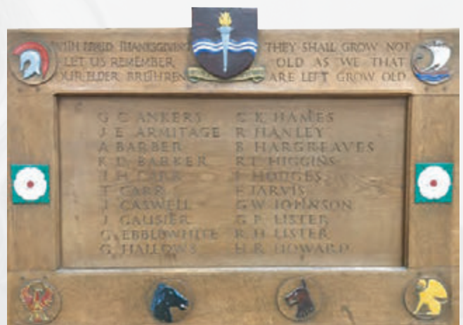
Above: Part of the school's war memorial, which includes the badges of all six houses

Today, the house system has been modernised for the 21st century, but is still built on the same sense of community envisaged by the school's founders.