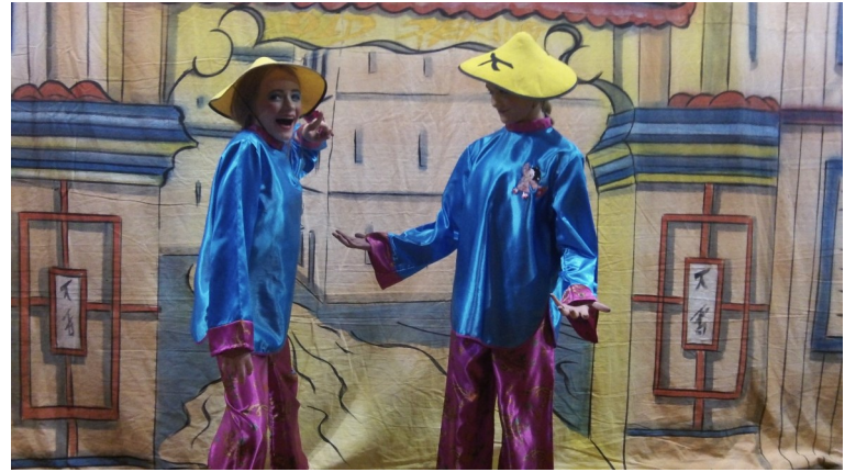
Costumes ranged from traditionally Chinese (above) to very British (below). Much of the work goes on behind the scenes to make the show flawless (below left).