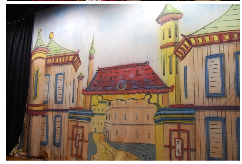
Not a snowflake in sight in Agrabah!

If you missed this fabulous theatrical treat, you should definitely make sure you secure yourself a ticket for next year's performance!