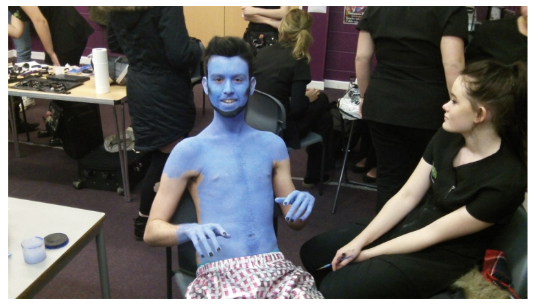
Transformation into a genie!