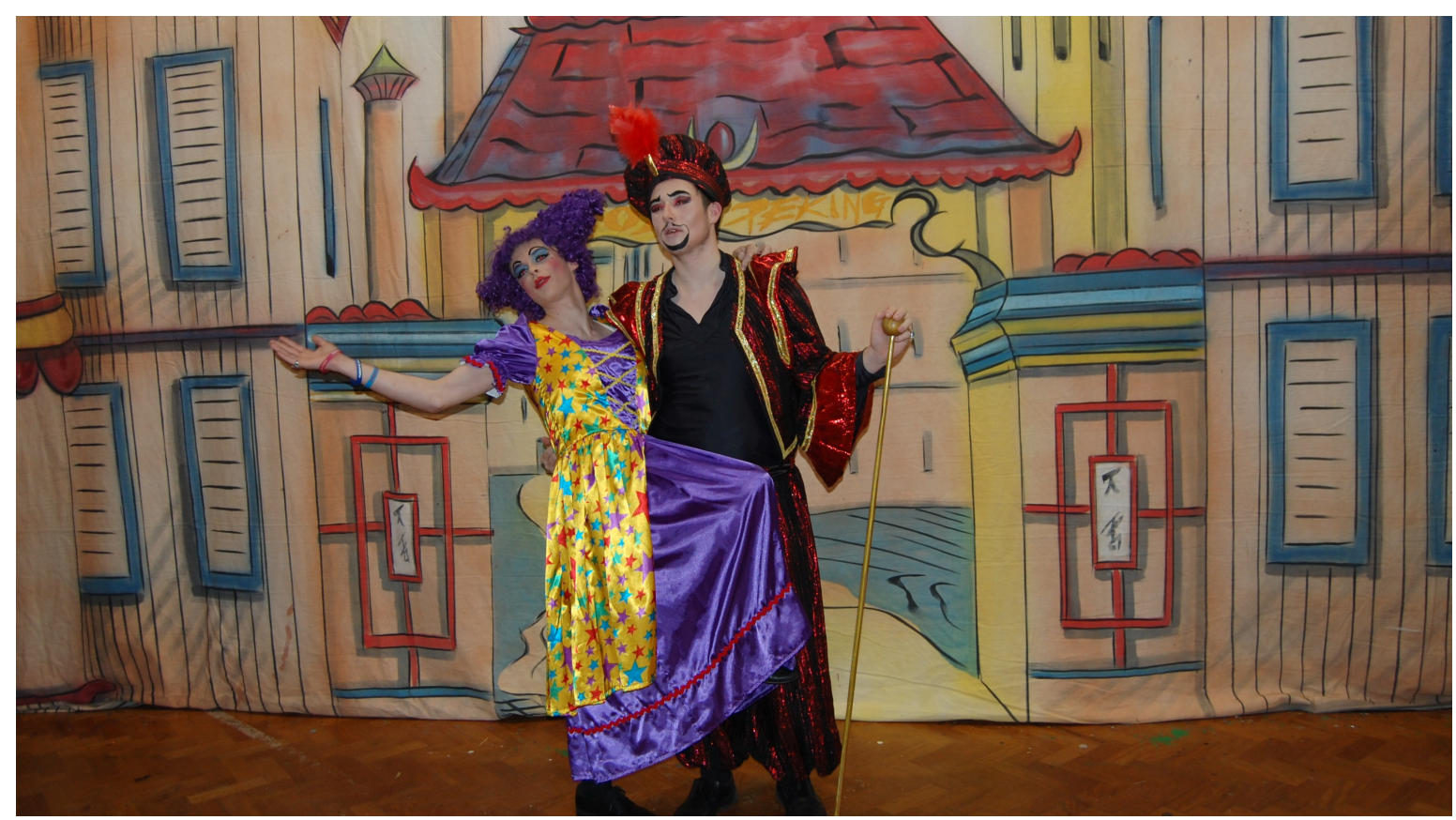
Where would a Panto be without a Dame (above)? Nobility strut their stuff (below left). There's no missing those eyebrows (below right)!