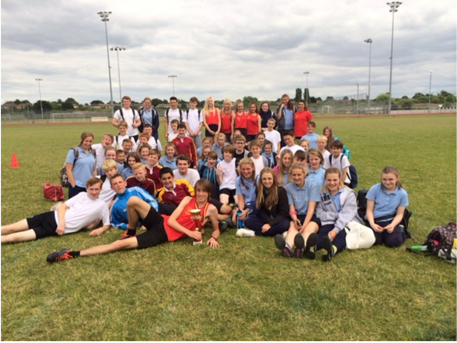
Exhausted but exhilarated: the Athenians celebrate their success and brandish the Sports Day trophy!

After a very close contest between all the houses, Athens stormed to victory in last year's successful Sports Day.