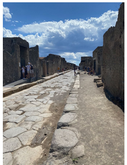
Pompeii, destroyed by a volcanic eruption

After visiting Mount Vesuvius, we followed up with a trip to Pompeii. Pompeii was a popular trading city that had a population of 12,000 prior to the eruption. After the devastating eruption, the majority of the population was wiped out, leaving a thick layer of ash covering the entirety of Pompeii for centuries.