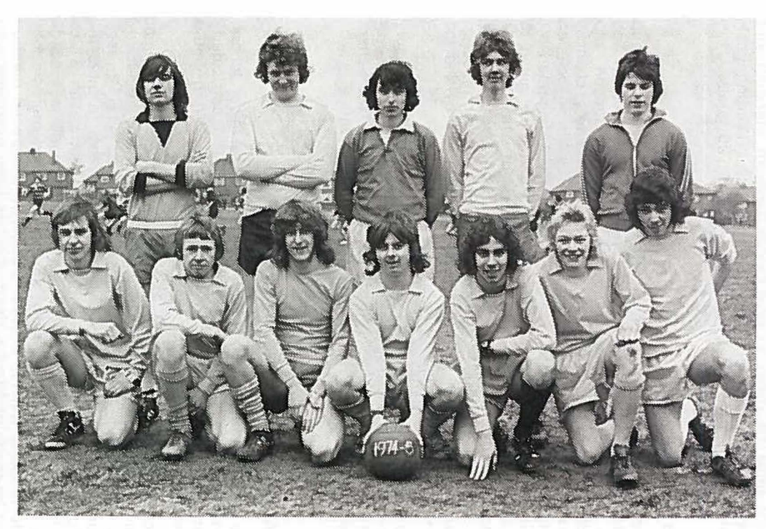
Second XI Football 1974-75