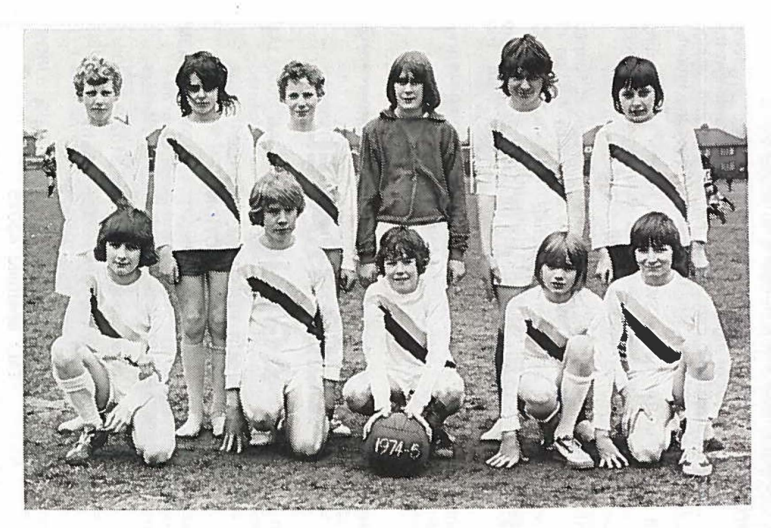
Under Thirteen Football 1974-75