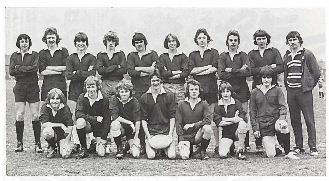
Under Fifteen Rugby 1974-75