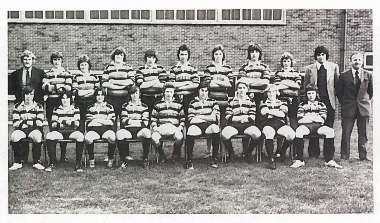
Under Sixteen Rugby XV 1974-75