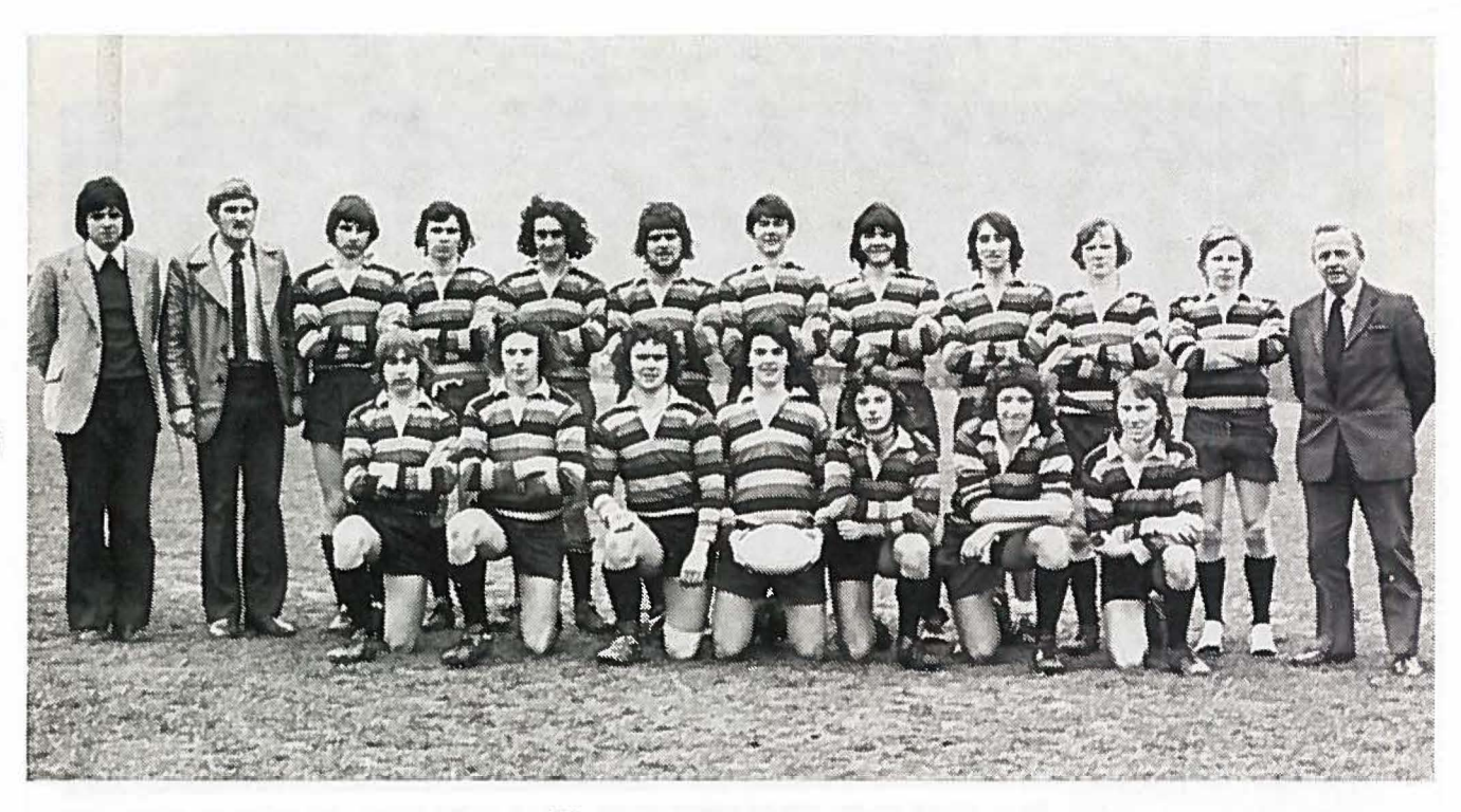
First XV Rugby 1974-75