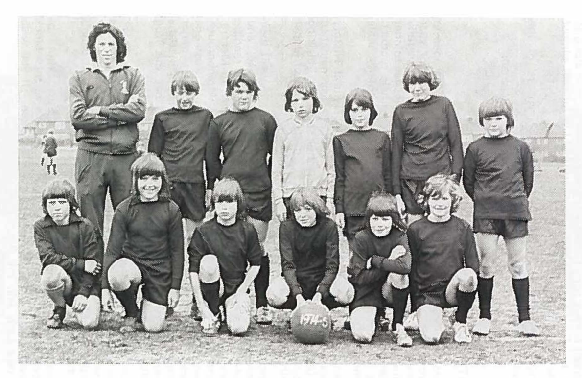
Under Twelve Football 1974-75