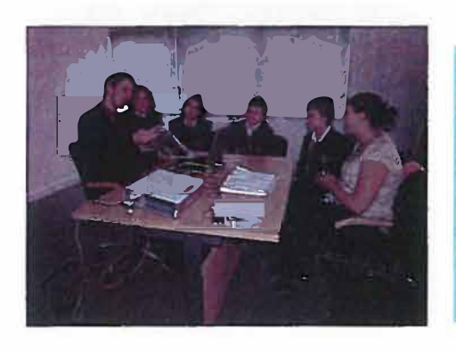
Students discussing which articles to include in the newspaper