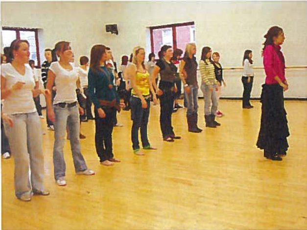
Put to the test in the Salsa lesson!

From the 22 nd to the 26 th of October this year, a group of 4 staff and 35 students ranging from Y9 to Y13 spent a week in Santander, a city in the north of Spain. The aim of the visit was primarily to encourage students to use their Spanish knowledge, but also to gain a greater understanding of Spanish culture and lifestyle.