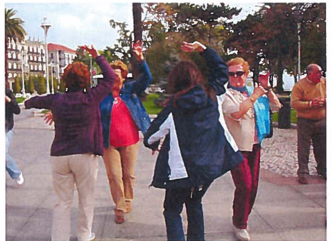
Miss Prada shows off her dancing skills...in the city's main square!

The group stayed in a hotel in the village of Comillas, about an hour away from the city itself, where there were plenty of opportunities to go shopping or to cafes and talk with the locals. During the week there were many excursions: they had a tour of the local caves, visited the picturesque village of Santillana de la Mar, and even went to a cheese factory!